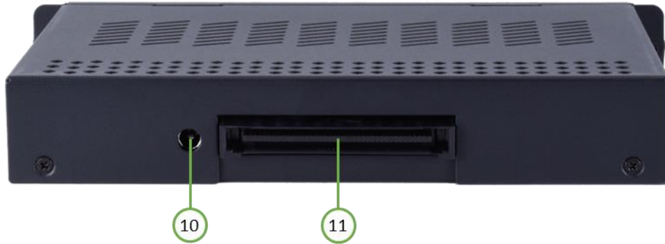
Figure 2: Back Panel Connectors

Connectors on the back side of the module are as follows.